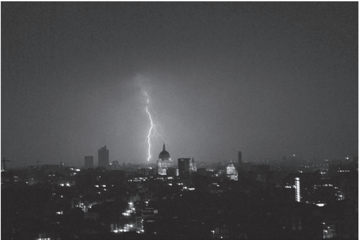
Lightning flash over St Paul's Cathedral, August 1973

the 1970 shot of lightning over London, which was published in the Daily Express, and my August 1973 shot of lightning over St Paul's Cathedral, which made the Evening Standard the following day.