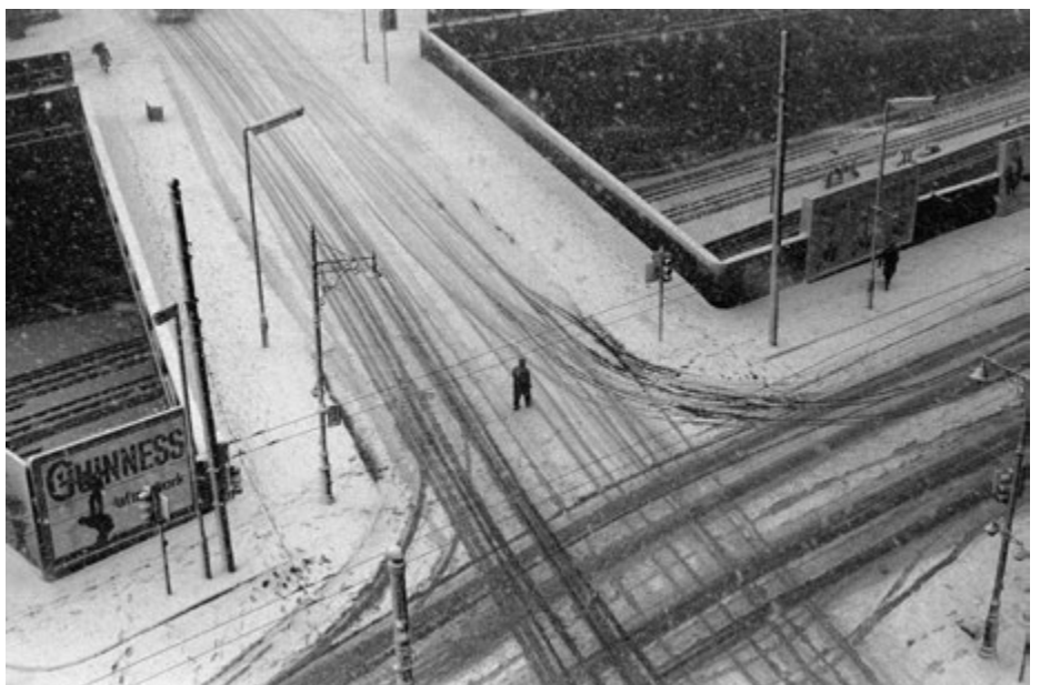
Junction of Clerkenwell Road and Farringdon Road, New Year's Eve, 1962

But I am not so fascinated by the grand view. I started out taking pictures of people in their everyday surroundings which is exactly what I still photograph today. I recently worked with a young photographer on a project featuring life in Whitechapel before, during and after the Olympics and we are currently working together on a long-term project in the West End. He shoots in colour, using a digital Leica, and I work in black and white.