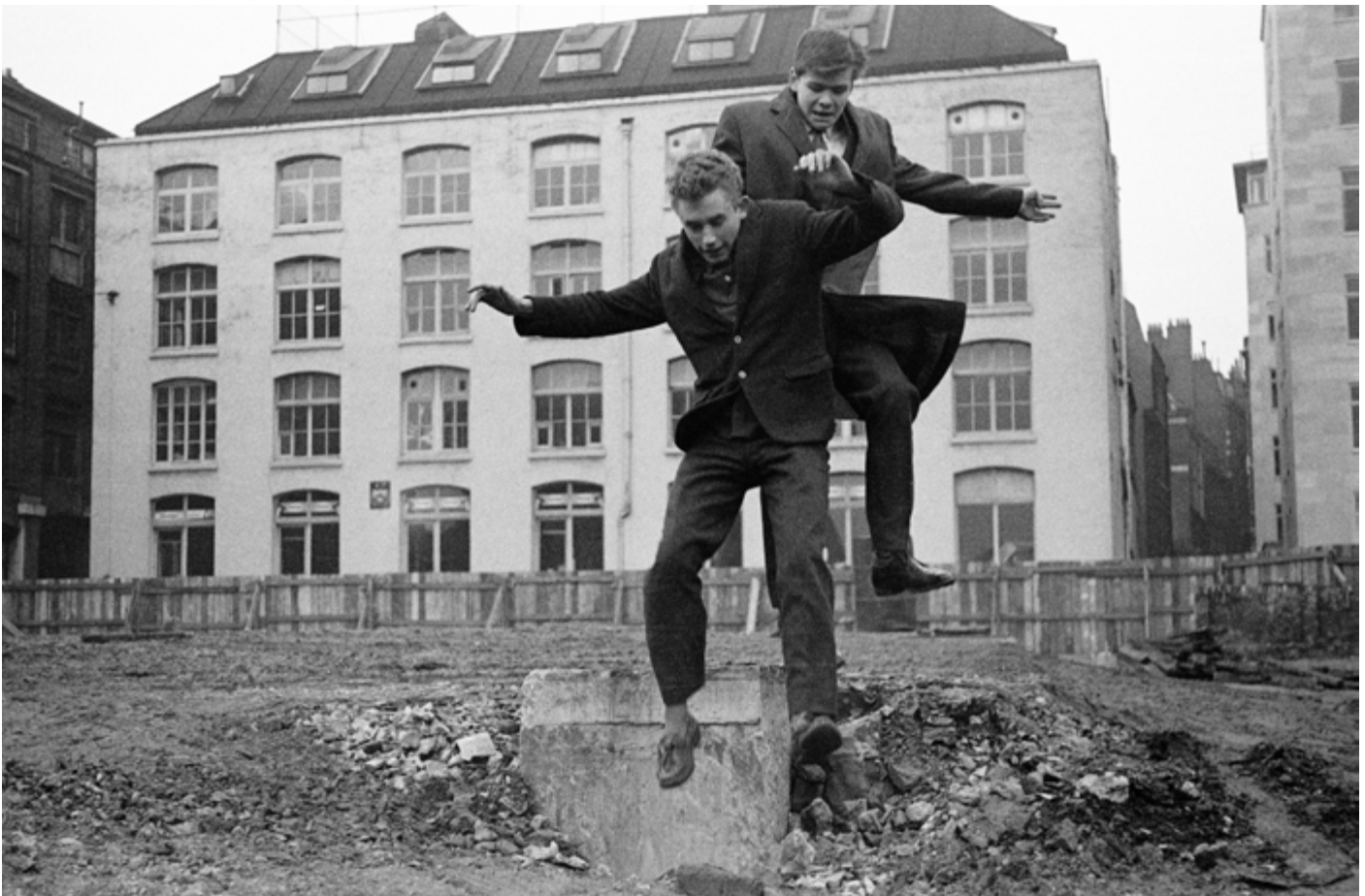
Two friends at Swan Wharf, 1956

● Digital photographers store vast numbers of images on their disks and drives, many never to be seen again, but film workers can also amass substantial collections over a lifetime of photography. How did you set about choosing images for London Life ?