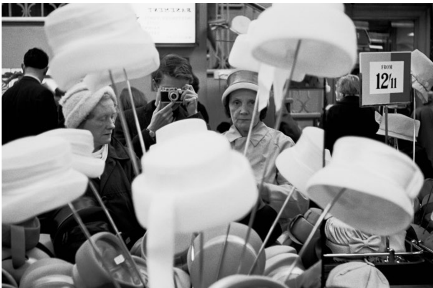
Shopping in Oxford Street, early 1960s

photographers and watching them at work.