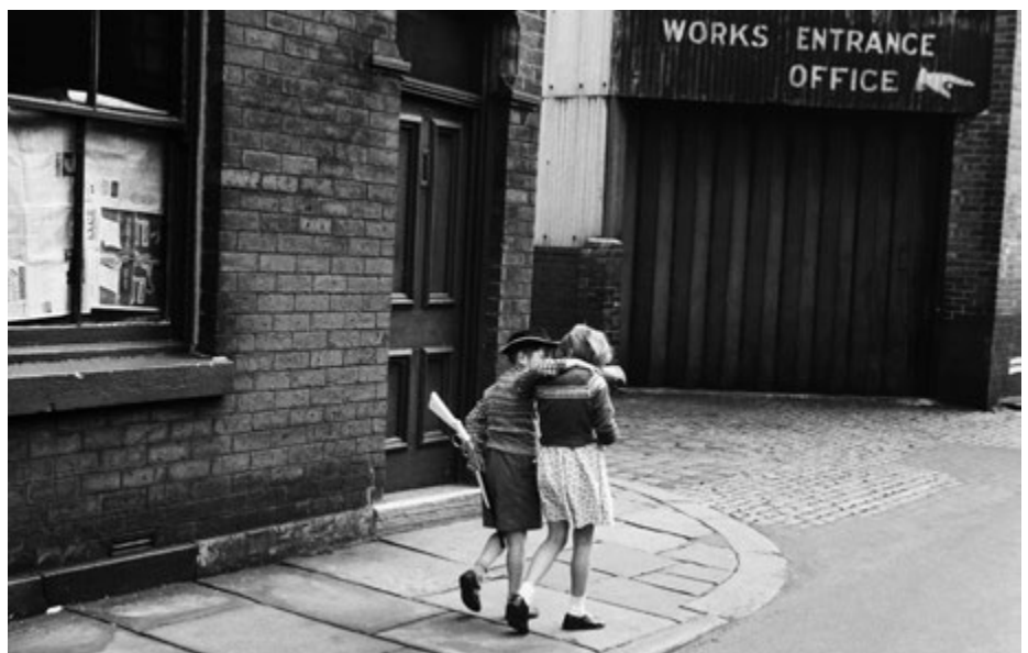
Cowboy and Girlfriend, Finsbury, 1960

My first job was at Fox Photos in the Farringdon Road. It was a leading Fleet Street picture agency and I worked in the library, sorting and fetching photographs for the clients all day. I remember trying to spend as much time as I could hanging around the downstairs darkroom, talking to the